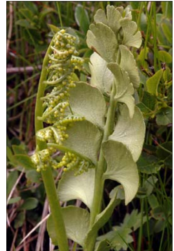
Botrychium lunaria

Some of the moonworts we might encounter are shown here.