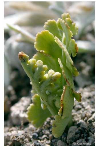
Botrychium pumicola

For updates between newsletters www.eldoradocnps.org