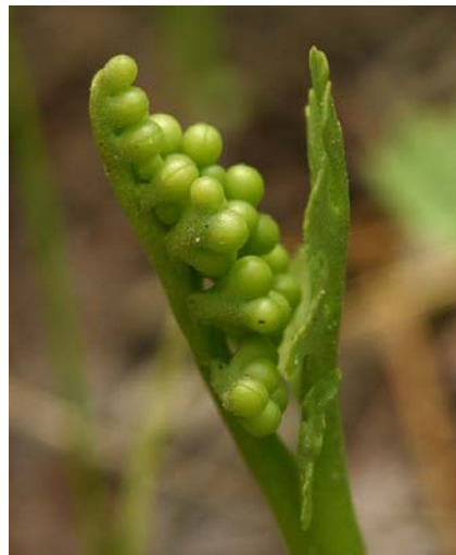
Botrychium ascendens