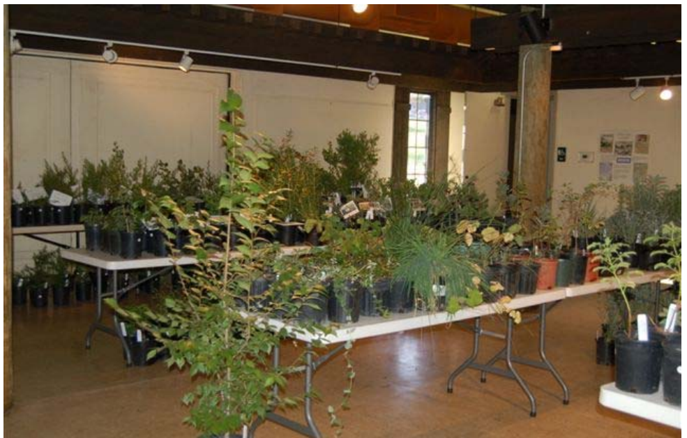
The plant sale offerings before the plunder!