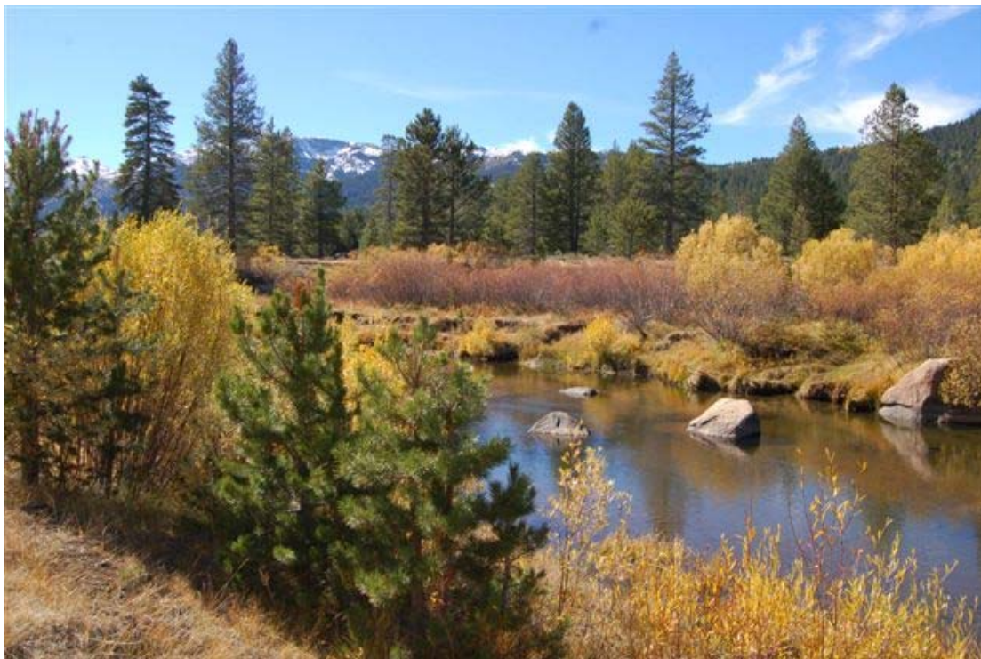
Fall colors at Hope Valley—the last field trip of 2009.